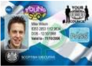
YOUNG SCOT CARD