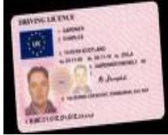
EU PHOTO DRIVER'S LICENCE IMMIGRATION